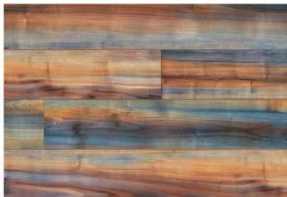
Pin Oak AP03