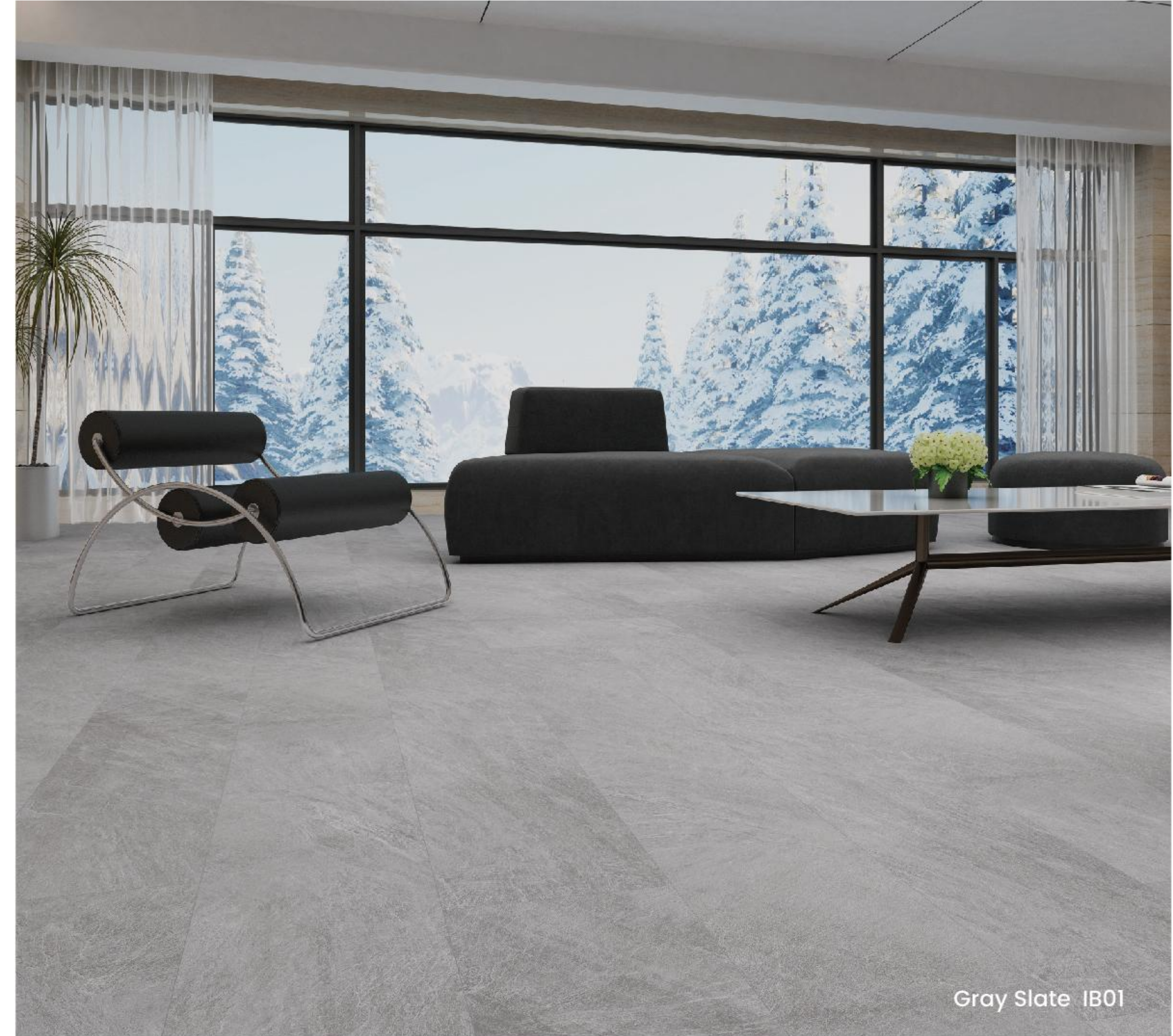
Gray Slate IB01