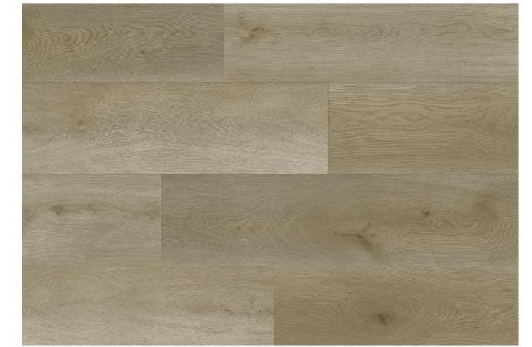
Drift Oak K02