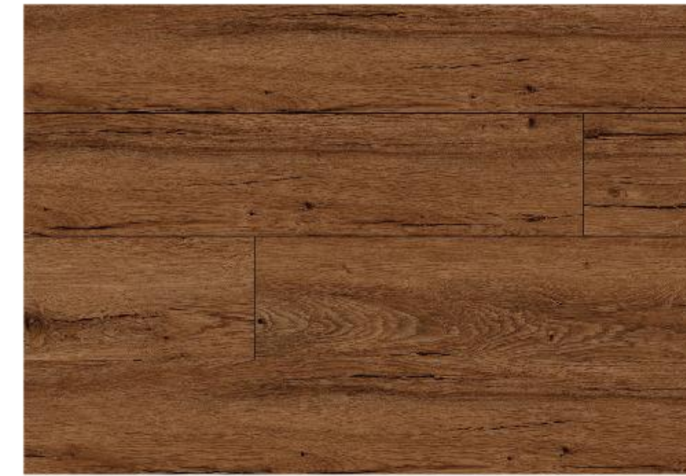
Hazel Oak K01