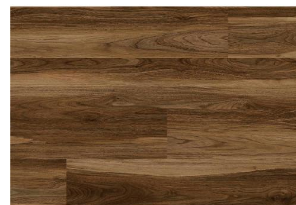
Brown Walnut AXL03