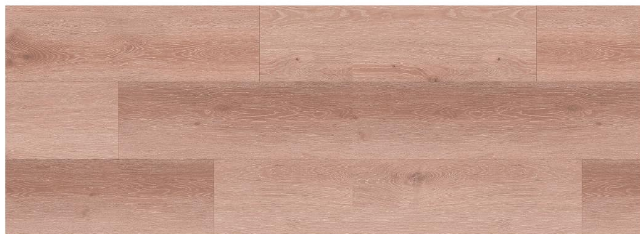
Strawberry Cream AP02