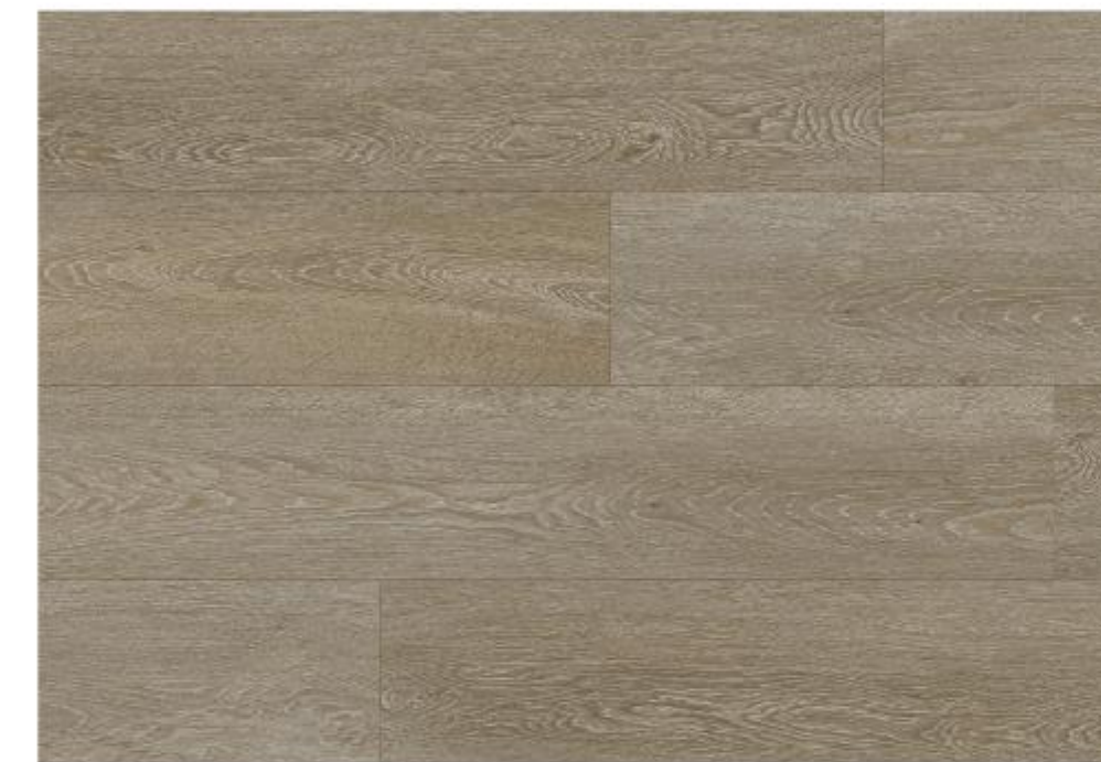
Meadow Oak K03