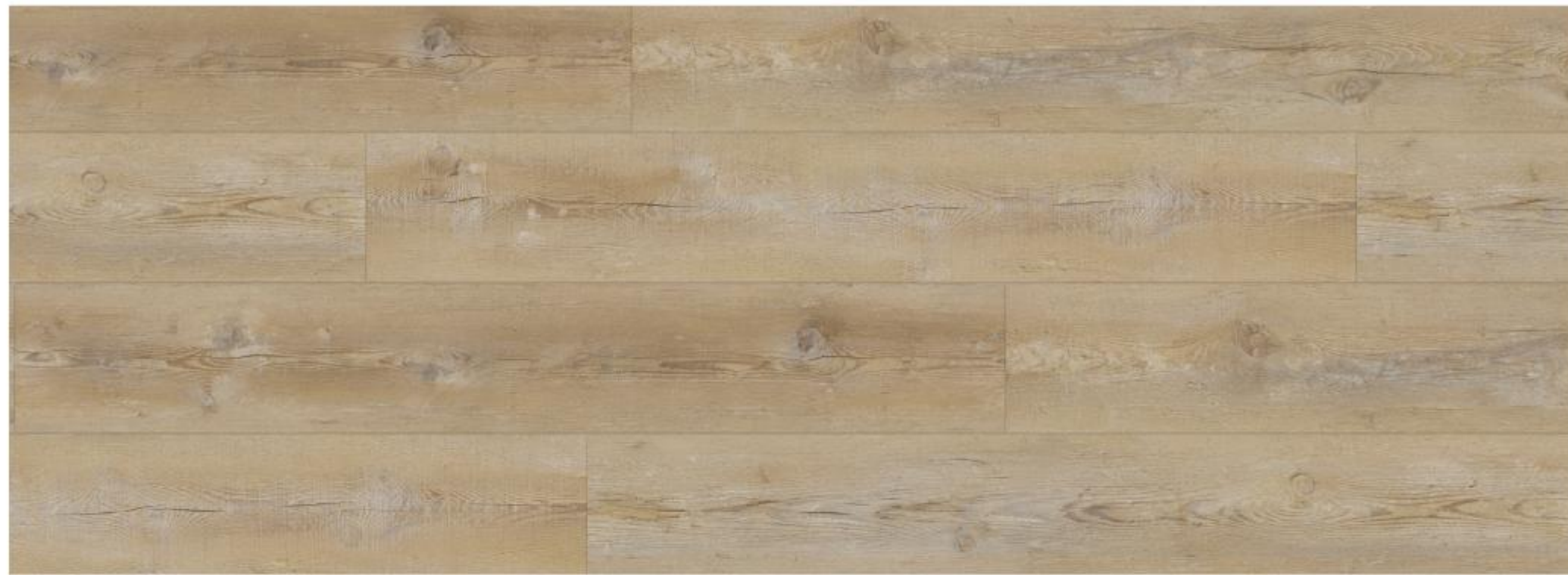
Brown Teak M01