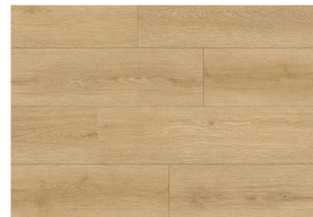
Wheat Oak AXL01