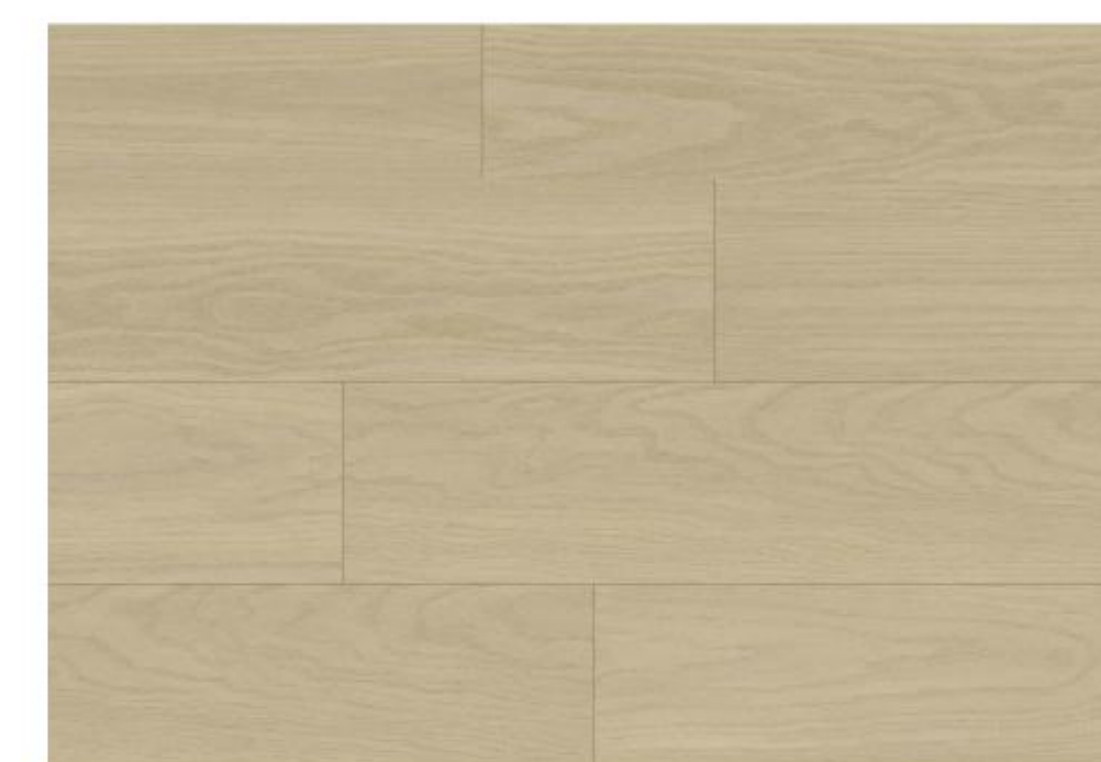
Shore Oak AXL04