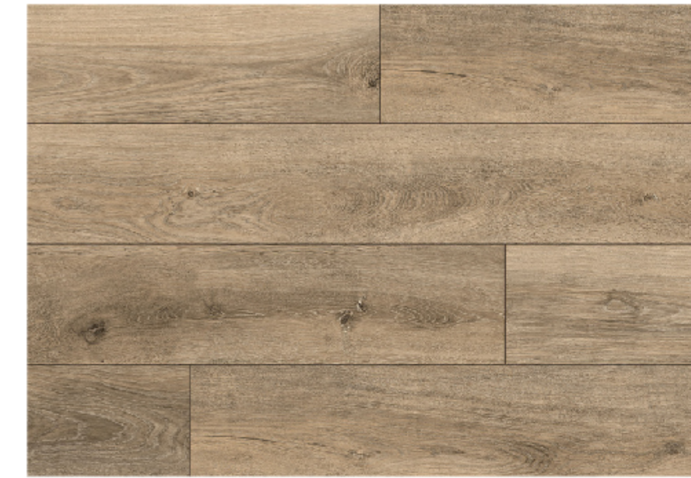
Chestnut Oak A01