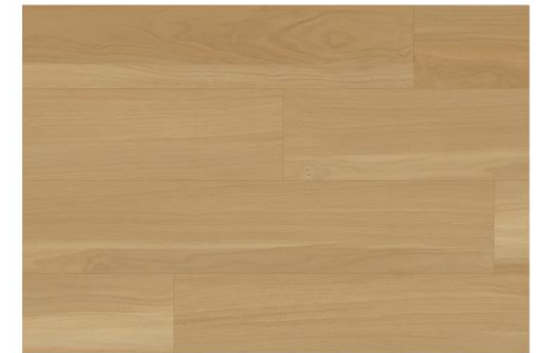
Golden Oak K04