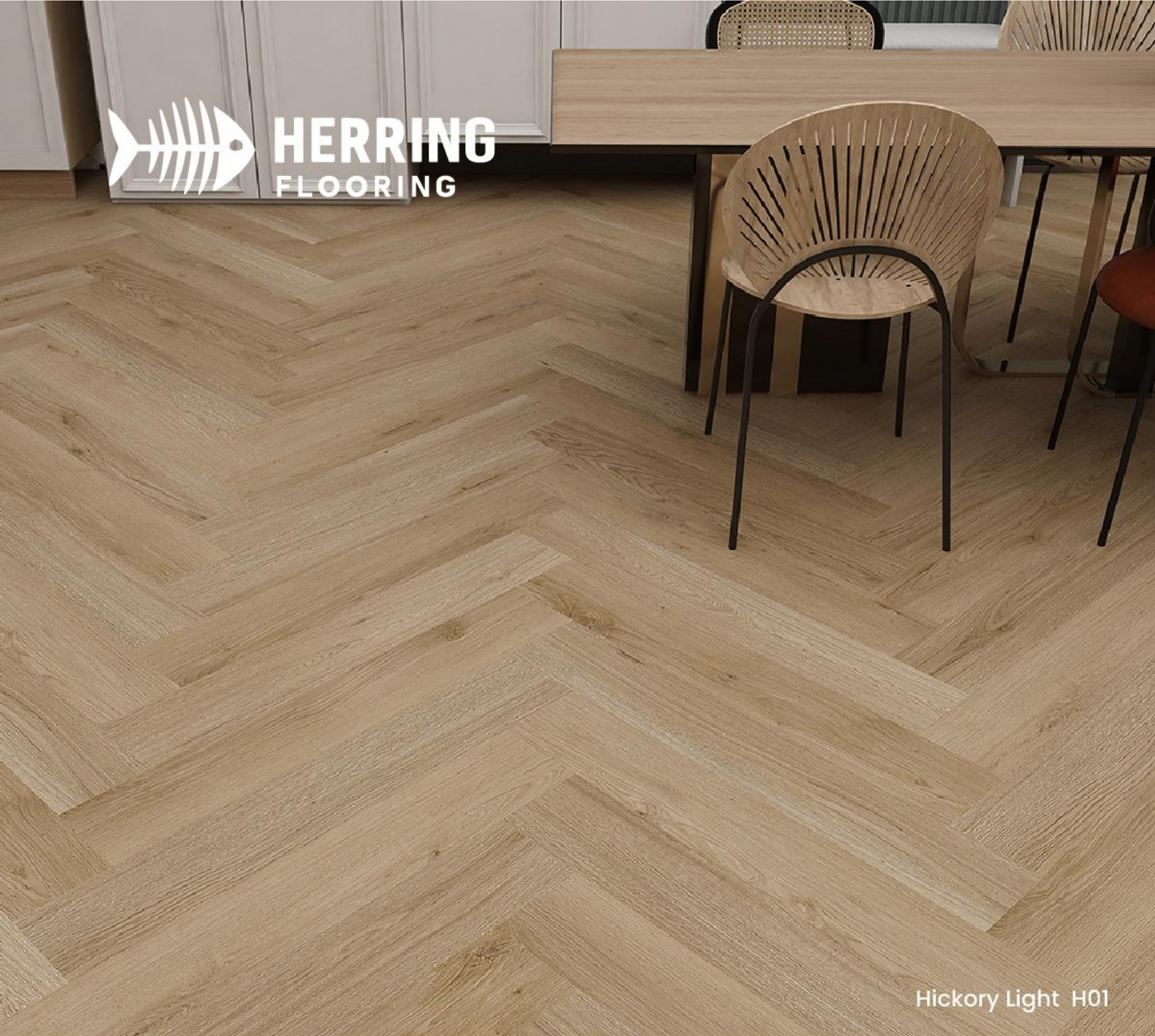
Hickory Light H01