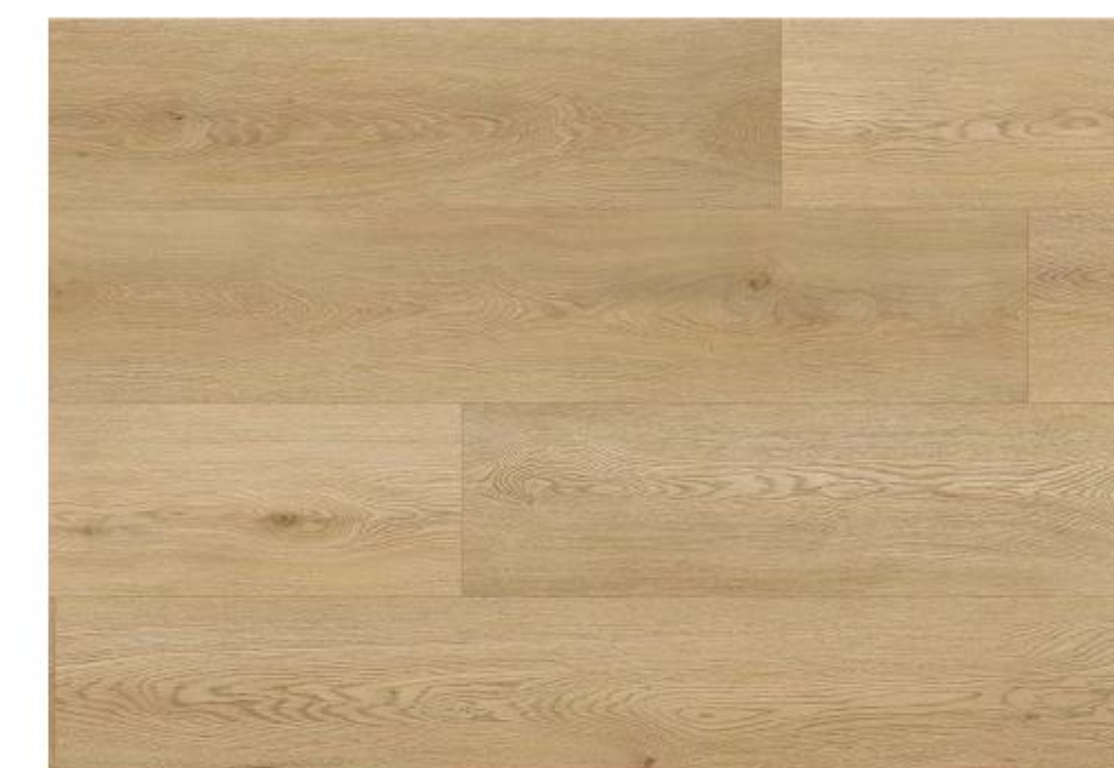
Whisper Oak AXL02