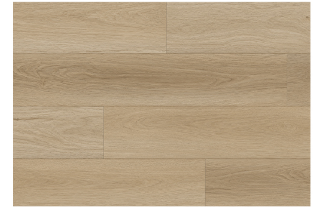
English Oak A04