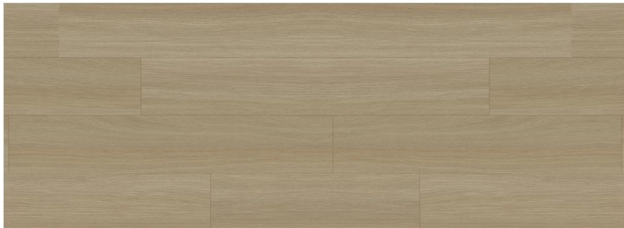
Mist Teak M02