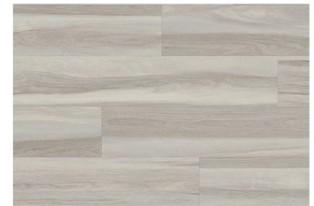
Willow Oak A02