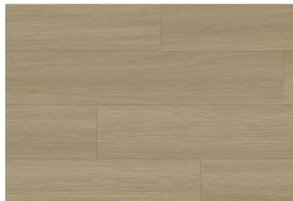
Silverveil Oak(Mercer) AP01