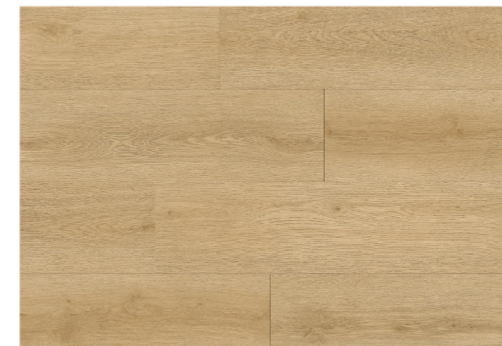
Silver Maple A03